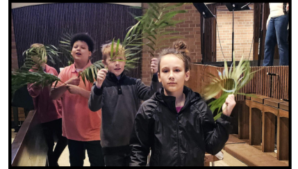
Each Palm Sunday, our palm parade comes to life as Sunday School children lead the congregation in song and wave palm branches in celebration.