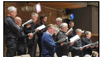
The men of the Olivet Choir sang a short carol as another organized group of Olivet musicians prepared to offer music during our Epiphany Event.