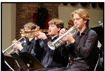
Here is a section of the Christmas Eve orchestra. They mean business!!