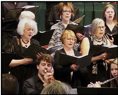
The Olivet Choir shares their voices on Music Sunday, supported by the rich accompaniment of a wind ensemble.