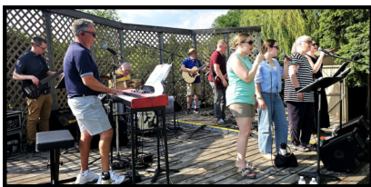
This past Summer our contemporary band and singers led three outdoor worship services.