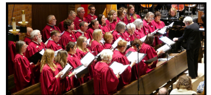
The beloved Christmas Eve Lessons & Carols Service, featuring choir anthems, congregational carols, and a multi-generational orchestra.