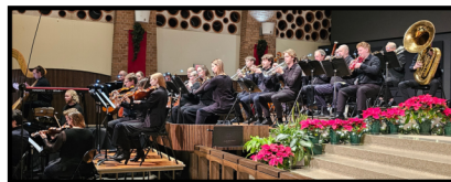
Our fabulous Christmas Eve orchestra, made up of musicians of all ages, and all careers. We love the music they make for us as we sing our carols.