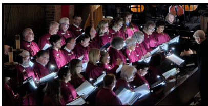
The Olivet Choir begins the Christmas Eve Lessons & Carols Service accompanied by a 28-piece orchestra.