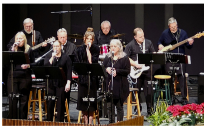
The Celebrate! Band was yet another one of Olivet's resident music organizations, who not only play every Sunday, but also saved several musical offerings for the Epiphany Event.