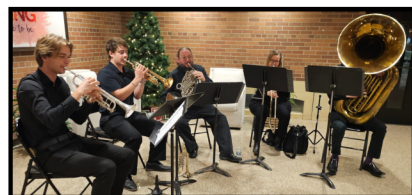
Throughout the year, a brass ensemble adds energy to special worship moments like Reformation, Christmas, Easter, and more—so it was only fitting to have brass carols at our Epiphany Event. And yes, there is a person behind that tuba!