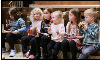
Budding percussionists regularly support the Celebrate! Band and singers, contributing to the vibrant conclusion of the second service each Sunday.

On behalf of our music leaders, we are deeply grateful for the opportunity to work with our musicians and to help create worship experiences that are meaningful, faithful, and enriching for our community.